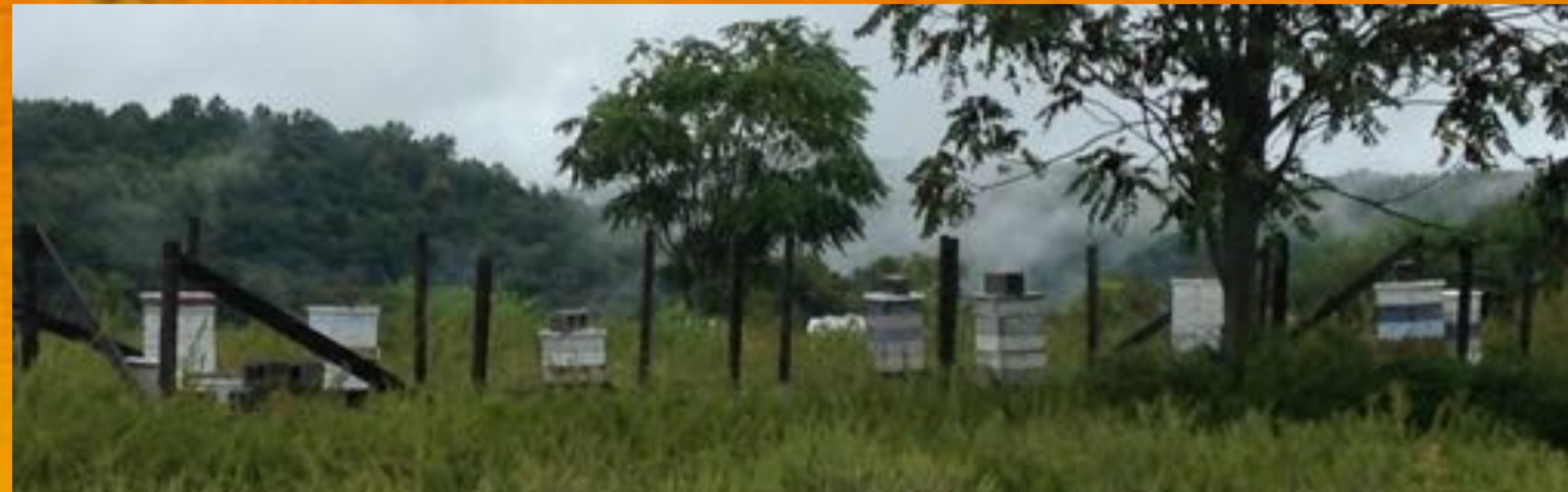
Coal Country BeeWorks, where students initially engaged honeybees, is an ongoing research project in how reclamation of defunct open-pit coal mine land can be achieved through apiforestation. It also seeks to engage area women in ways to improve their economic status using local and traditional resources.

Engagement: In the bee class, the knowledge many students have about declining bee populations is used to ask the question of what factors may be responsible. Generally, students come into the course knowing that bee loss is a critical issue, but also with the understanding that this is caused by pesticide use. The streambed courses have two foci of engagement. In Kentucky, political debate is focused on coal as a driver of local economics. In addition, our largely rural students have familiarity with streambeds, but more to the point is the intersection of the two issues, that the coal industry has impacted negatively on both stream and health quality and positively on employment, and that our students are very much aware of these issues.