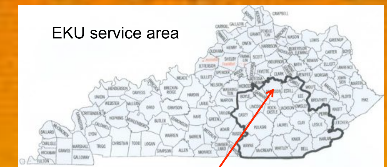
EKU service area

A second service project has been the utilization of video production technology to develop "public service announcements" related to the topics of the course. Student technological savvy and creativity have been impressive, and we are working with state educational television both to improve our capabilities and eventually to run the students' work on air.