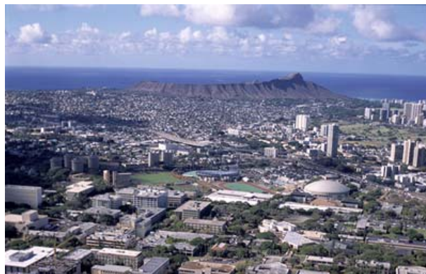
University of Hawai'i, Manoa

University of Minnesota, Twin Cities plans to design one new biology course for non-science majors and SENCERize a biology course for science majors. Both courses are proposed for the Fall 2007.