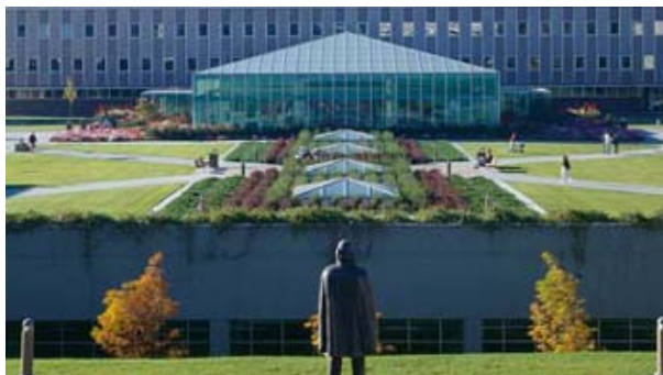
Brigham Young University

Butler University will develop multiple SENCER courses for 2007 that will strengthen and sustain already established community-based partnerships. One proposed course is a Junior/Senior Capstone, "Topics in American and Global Society."