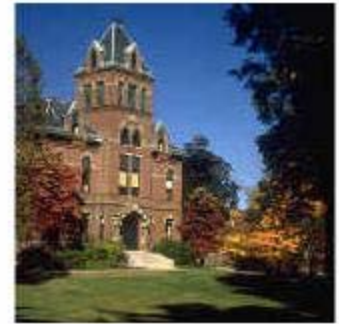
University of Southern Maine

Woodbury University plans to create their first SENCER course during the academic year following attendance at SSI 2006 and proposes to develop a course each year following the Institute. Water will be the focus of the initial course and Woodbury will incorporate intensive assessment and evaluation strategies throughout the development and implementation process.